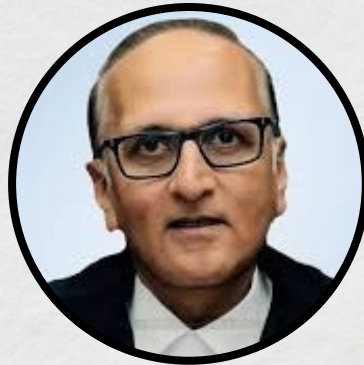
HON'BLE MR. JUSTICE RAVINDRA BHATT

Former Judge, Supreme Court of India Former President, NCDRC & Patron in Chief Centre For Public Policy And Good Governance