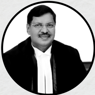
HON'BLE MR. JUSTICE BHUSHAN RAMKRISHNA GAVAI

Hon'ble Chief Justice of India & Hon'ble Visitor Dr. B.R. Ambedkar National Law University, Sonapat