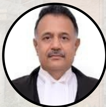
HON'BLE MR. JUSTICE RAVI SHANKAR JHA

Former Judge, Supreme Court of India & Patron in Chief Centre For Conflict Management & Dispute Resolution